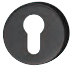
Euro profile cylinder escutcheon