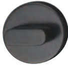
WC release and inside turn