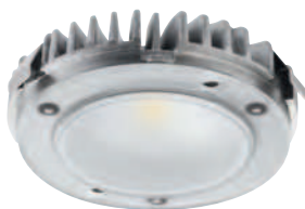
Loox5 12V LED 2025 downlight, Ø 65 mm