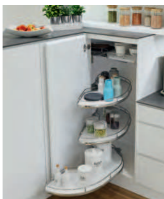
Photo and illustration shows extension pole, 542.02.001 in use with 2x Cornerstone Maxx pull out unit with shelves, 542.02.292