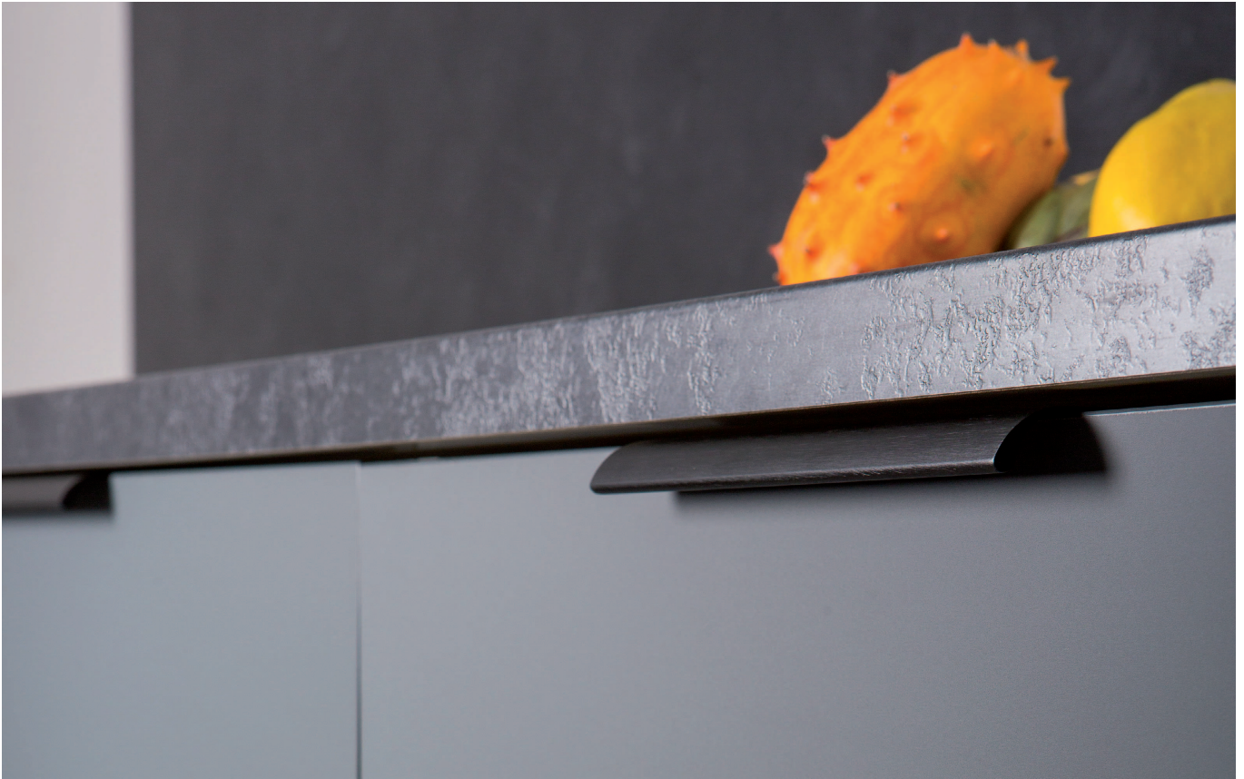
ONA profile handle