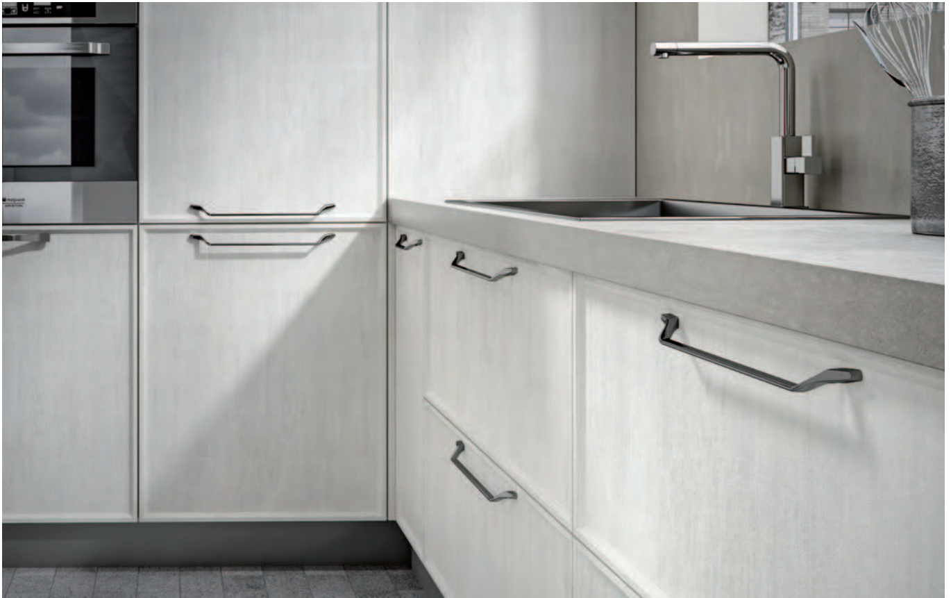
OSAKA pull handle