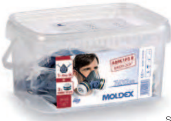
Supplied in a resealable container