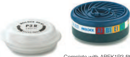
Complete with ABEK1P3 filters: Moldex 9030 P3 R + Moldex 9400 A1B1E1K1