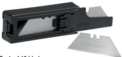
Pack of 10 blades