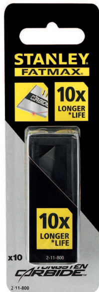
Pack of 10 blades